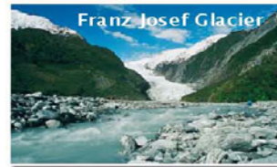
Franz Josef Glacier